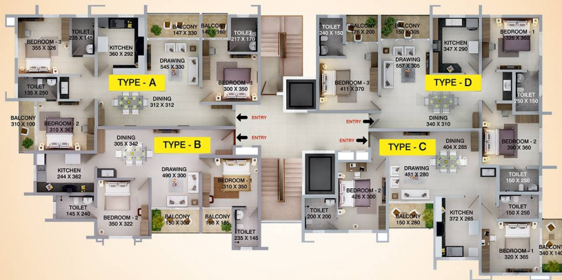
1 to 12 th FLOOR PLAN