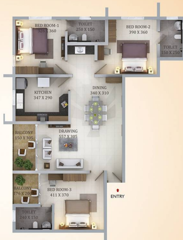
TYPE - D 3 BHK 1525 SQ.FT.