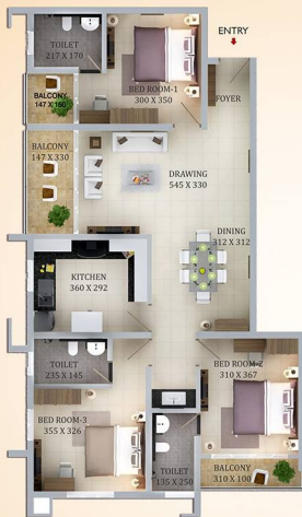
TYPE - A 3 BHK | 1540 SQ.FT.