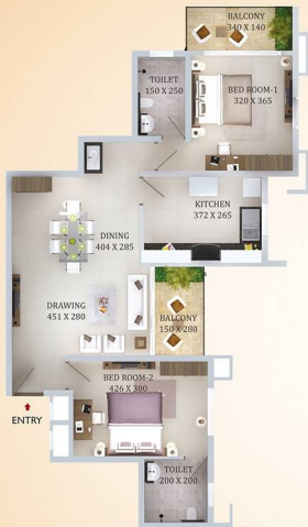
TYPE - C 2 BHK 1230 SQ.FT.