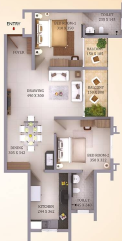
TYPE - B 2 BHK | 1135 SQ.FT.